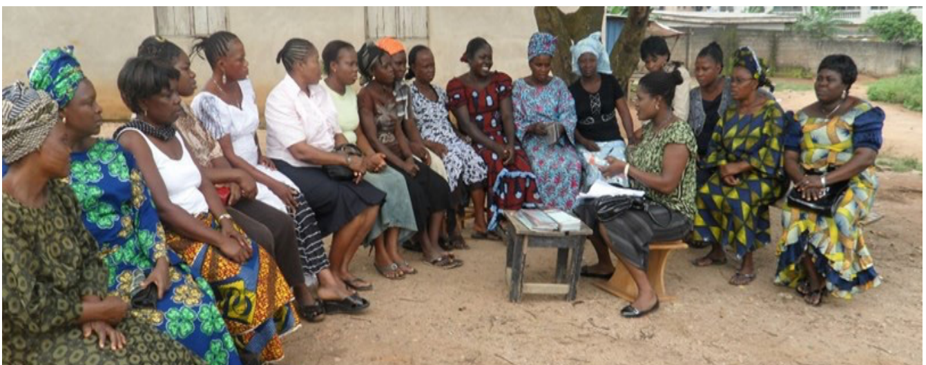
Weekly group meeting at Ogba, Lagos State, Nigeria July, 2017

LAPO has over the years made huge investment in capacity development of its staff particularly towards delivering services to its women customers. The Loan officers or client support officers (CSOs) are trained on delivering financial services and supporting female clients in matters of basic business management, career choice for their children and maternal and child health.