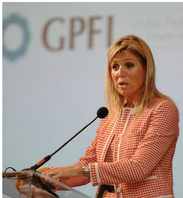
H.R.H. Princess Máxima of the Netherlands, the UN Secretary-General’s Special Advocate for Inclusive Finance for Development (UNSGSA), provides keynote addresses at the conclusion of the AFI Global Policy Forum and opening of the GPFI Forum

Inclusion now matters to whole financial systems and to equitable, sustained growth... [It is] about providing everyone with a tool that helps you fulfill your basic needs... And the good news is: we are making it happen.