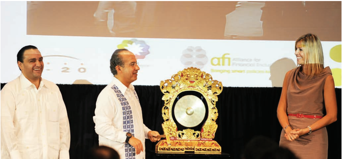
President Calderón and H.R.H. Princess Máxima of the Netherlands, UNSG's Special Advocate for Inclusive Finance for Development and Honorary Patron of the G20 Global Partnership for Financial Inclusion, at the opening of the GPFI Forum

In his speech, President Calderón announced the launch of Mexico's National Council on Financial Inclusion (NCFI) , a body that brings together all Mexican public authorities with an interest in financial inclusion in order to work toward a coordinated and mutually agreed policy agenda. The Council "shall be responsible for measures for the planning, preparation, implementation, execution, and follow-up of a national policy on financial inclusion". In addition, it will coordinate financial education efforts and consider whether the country's financial infrastructure needs to be altered. Acknowledging the critical importance of financial inclusion data in developing policy, the Council will also approve or regulate the statistical instruments used to measure Mexico's progress in financial inclusion.