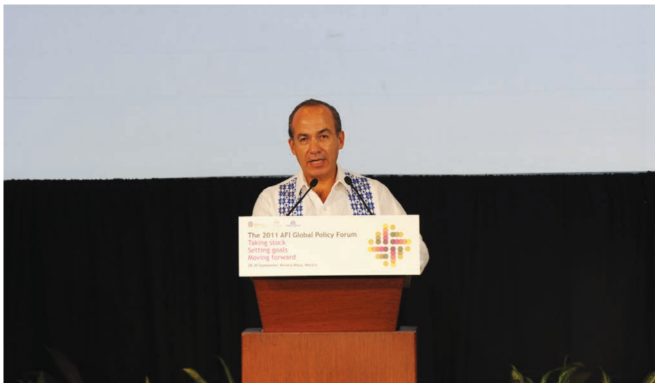
H.E. Felipe Calderón Hinojosa, President of Mexico, officially closes the AFI Global Policy Forum and opens the GPF Forum

In advancing financial inclusion, international cooperation and the exchange of ideas and proposals are crucial. For that reason, Mexico will continue fostering debates on such topics, in its capacity as an AFI member and as chair of the G20.