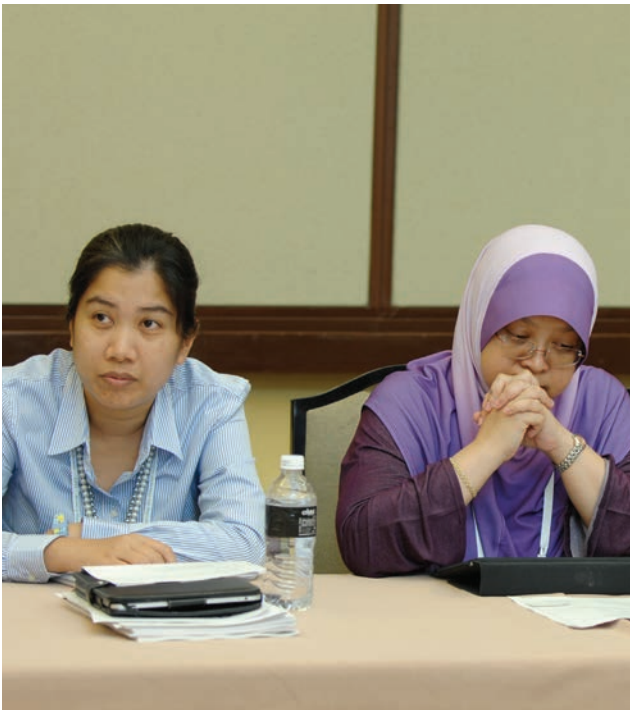
Representatives of Bank of Thailand and Bank Negara Malaysia participate in the GPFi Data and Measurement Subgroup's discussions