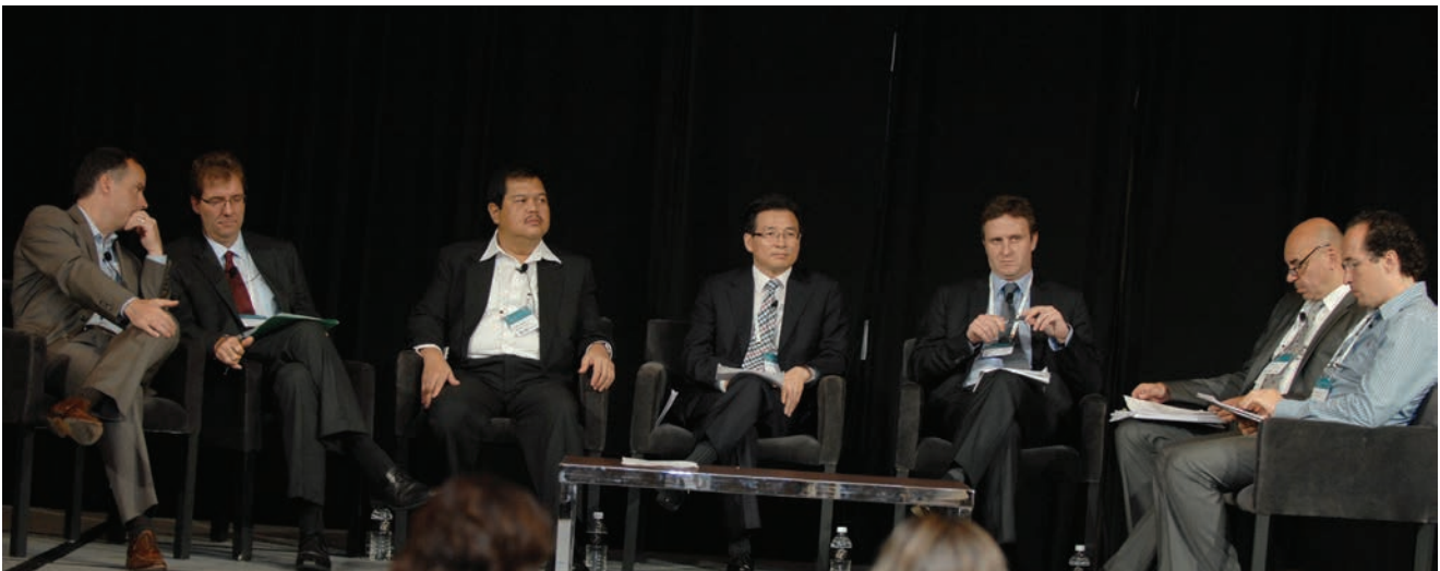
GPFi co-chairs and delegates close the first GPFi Forum

We will push this topic to the leaders' agenda, and together with the creation of national financial inclusion commissions in other countries we will try to include financial education and consumer protection in a work stream that results in concrete proposals that can be widely adopted.