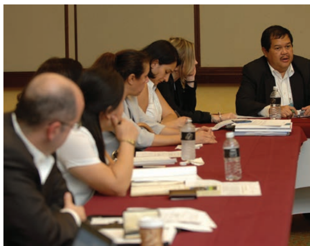
Deputy Governor Nestor Espenilla, Jr., Bangko Sentral ng Pilipinas, interacts with GPMI delegates