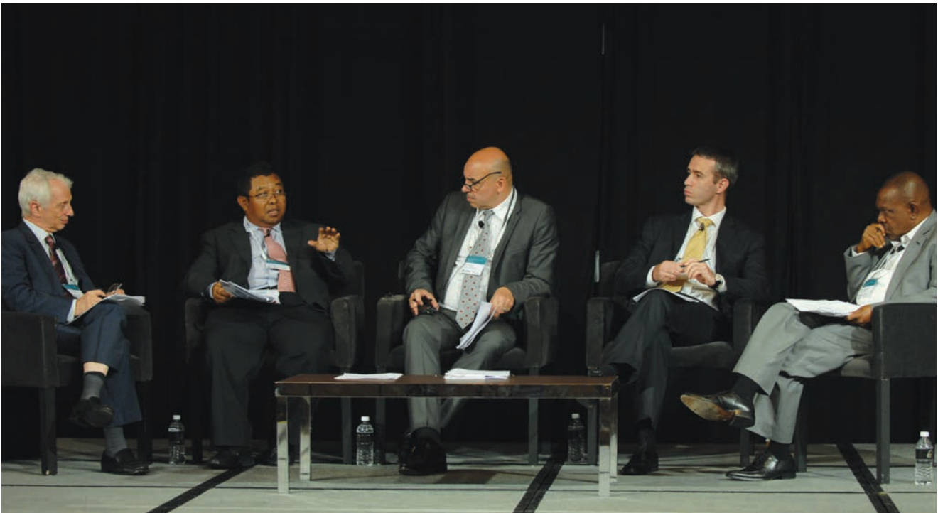
Panelists discuss the G20 Principles for Innovative Financial Inclusion

This panel discussion was dedicated to exploring how the G20 Principles have been implemented in various countries. The panel also discussed how the principles can contribute to achieving the GPFI's vision of universal financial inclusion. Panelists presented the experiences of four countries: the UK, Nigeria, Russia, and Indonesia. An 11 country case study report, "Bringing the Principles to Life" (produced by AFI on behalf of the GPFI and published in conjunction with the GPFI Forum), was distributed to participants. 6