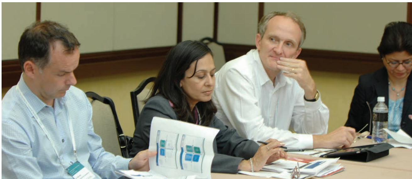
Members of the GPFi Data and Measurement sub-group present their findings from the past 11 months