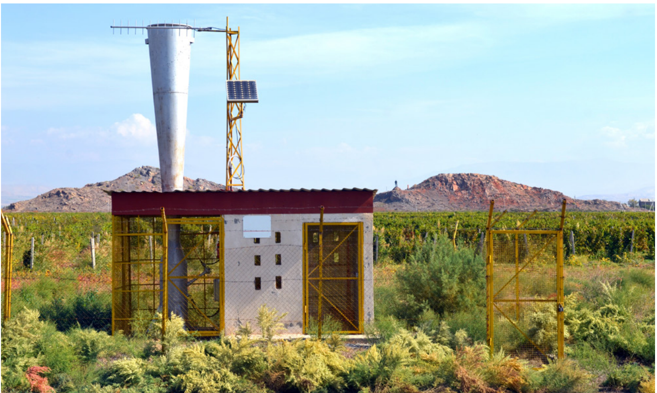
Anti-hail plant for generating a shock wave in a vineyard. Ilusarat village, Ararat province, Armenia.