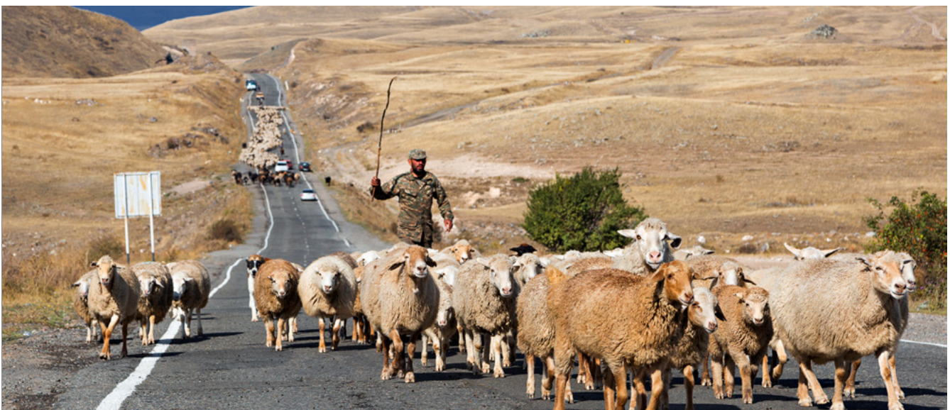
A shepherd gets his herd of sheep across the road near the village of Tatev in Armenia.