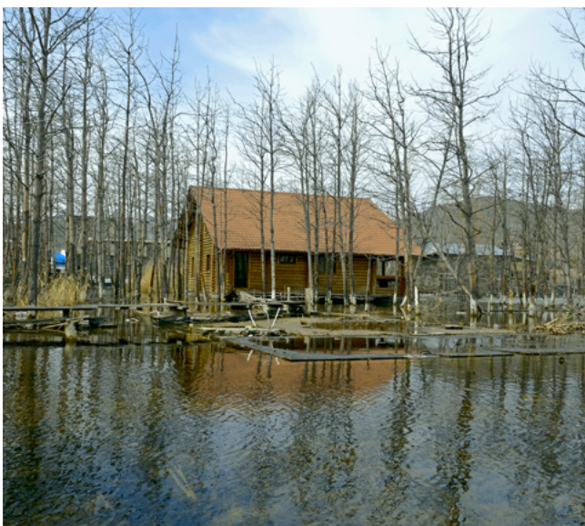
Half-submerged wooden house in Lake Sevan, Armenia.

Armenia's climate is characterized by relatively cool temperatures. The average annual temperature (1960-2015) is 7.6 degrees Celsius, ranging from -8°C in the high mountains to 12° to 14°C in low valleys. Climate stressors, such as rising temperatures, increased storms, changes in seasonal precipitation, lower rainfall and more drought, pose various risks to the Armenian economy. The country has a history of drought, significant land degradation and active desertification.