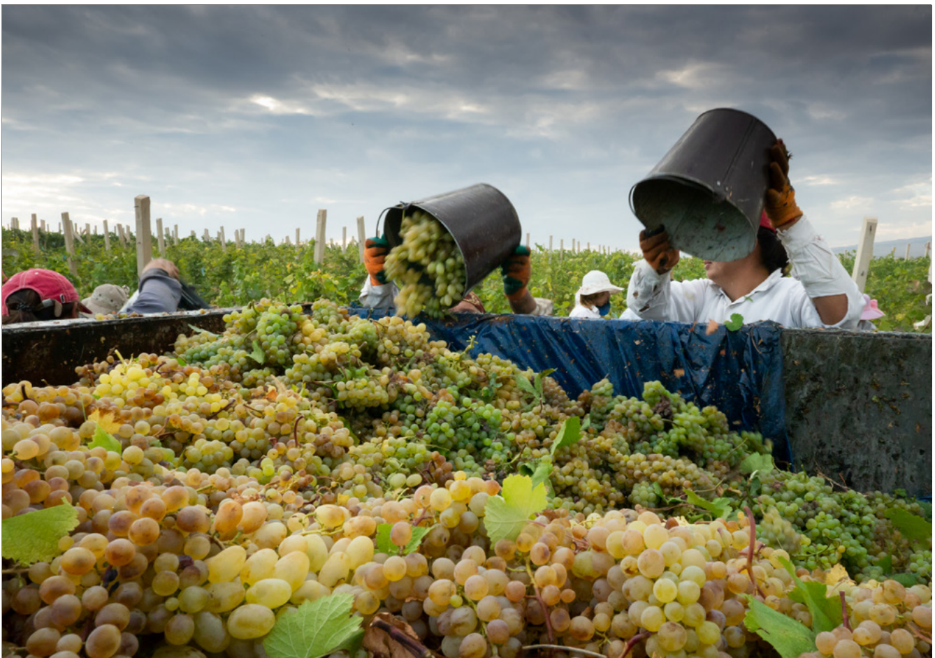
Harvesting grapes at a vineyard in Armas Winery, Aragatsotn Province, Armenia.

Agricultural insurance is just one component of Armenia's comprehensive risk management approach. Building, modernizing and maintaining infrastructure like weather stations, developing and modernizing agricultural risk mitigation technologies, supporting agro-meteorological research and providing farmers with technical assistance and education about insurance, will all help to sustain agricultural insurance and risk evaluation.