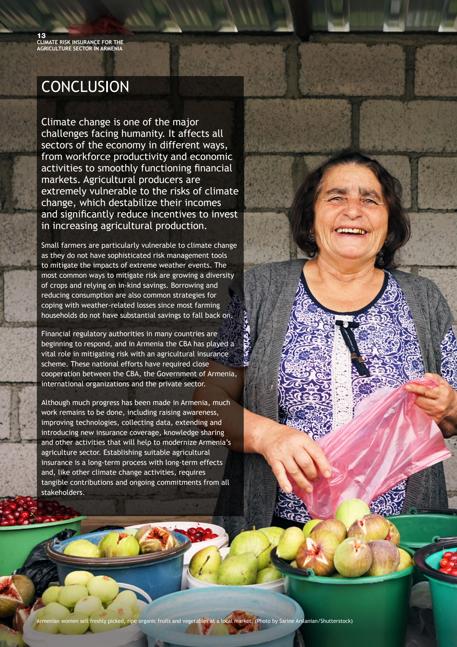
Armenian women sell freshly picked, ripe organic fruits and vegetables at a local market.

Although much progress has been made in Armenia, much work remains to be done, including raising awareness, improving technologies, collecting data, extending and introducing new insurance coverage, knowledge sharing and other activities that will help to modernize Armenia's agriculture sector. Establishing suitable agricultural insurance is a long-term process with long-term effects and, like other climate change activities, requires tangible contributions and ongoing commitments from all stakeholders.