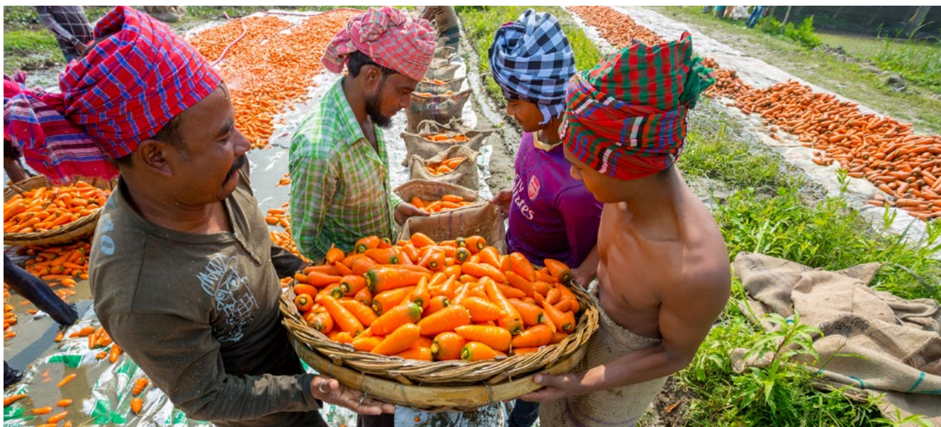
After harvest farmers are putting fresh carrots in jute bags and preparing for export, Bangladesh. January 2020.

Bank branch expansion into underserved rural areas is also being encouraged, alongside a campaign of opening no-frills bank accounts for poor sharecroppers, day labourers and others in the lowest income brackets. The minimum deposit is as low as (Bangladesh Taka) BDT10 (equivalent to 12 US cents at the time of reporting). The campaign has been hugely successful, with over 13 million new bank accounts already opened, a major milestone in financial inclusion. Besides the intended use for receipt of social safety net allowances and farming input subsidies, other payment, receipt and savings transactions are also increasing in these accounts.