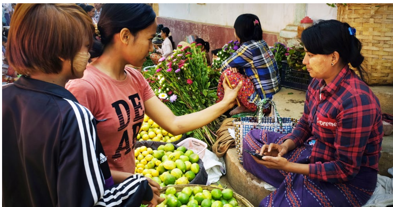
Mobile payment at a local vegetable market in Myanmar. February 2019.

Between 2015 and 2017, an increasing number of AFI members voiced interest in scaling up peer learning on ways to develop and implement financial inclusion policies that also have positive environmental outcomes. This momentum culminated in September 2017 with the launch of the Sharm El Sheikh Accord on Financial Inclusion, Climate Change and Green Finance, endorsed by an overwhelming 94% of the AFI membership.