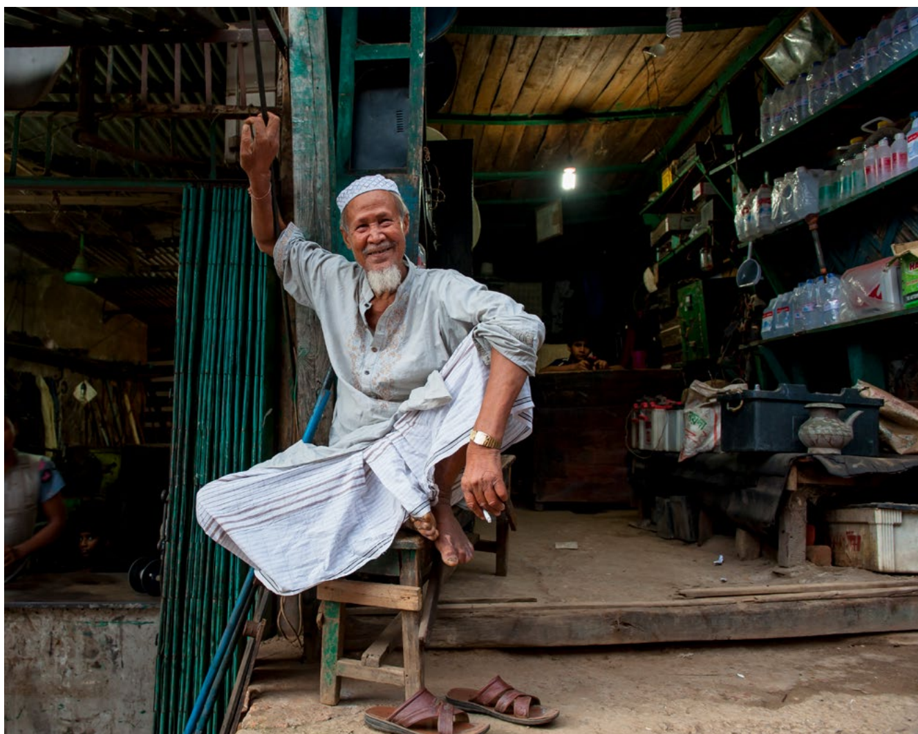
A man is sitting in front of his shop in a small street at sunset moment, Rangamati, Bangladesh. September 2013.

Within the context of the development goals, we then provide a more detailed definition of SRF, examining the role of financial institutions. Finally, we look for lessons on best practices in fellow emerging economies, as well as high-income countries, to ensure that we have a robust national strategy that underpins sustainable growth.