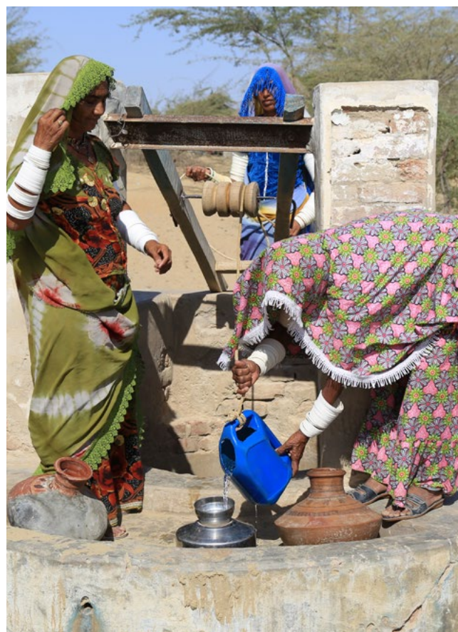
Women carrying and filling water buckets pot from well in, Thar Desert, Pakistan. March 2019.

Gender-responsive budgeting has been enacted in Bangladesh since 2009 to support the participation of women in a wide range of different programs. Various ministries have adopted gender-responsive budgeting, and accountable and responsible spending in their budget in support of the social and economic empowerment of women. Bangladesh is making headway in terms of educational attainment and has achieved parity at primary-school level in most regions, but is performing relatively poorly on indicators such as adolescent pregnancy, the proportion of young women married before the age of 15 and the proportion of women in managerial roles. Although the practice of giving dowries is now illegal, there is still much social pressure on families and this puts an increased burden of poorer families with girls, who are often seen as a burden. Perhaps the gravest concern is that rates of physical and sexual abuse are high by international standards. However, the government has shown its conviction towards supporting the Convention on the Elimination of All Forms of Discrimination against Women (CEDAW) and the Beijing Platform for Action. Bangladesh has a Global Inequality Index (2018) value of 0.536, ranking it 129 out of 162 1 . Fortunately, these indicators are improving with time. However, policymakers must speed up the rate of activity if the country is to achieve targets by 2030.