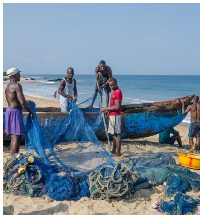
Fishermen sorting nets at Robertsport beach, Liberia. January 2014.

Access to Finance Initiatives has three broad categories, namely, SMEs, agriculture and mortgage initiatives.